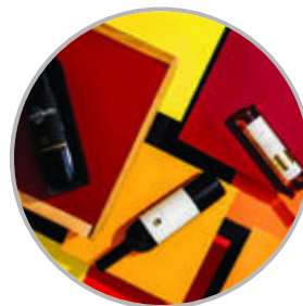
TOP 100 CELLAR SELECTIONS OF 2018