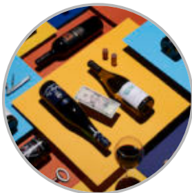
TOP 100 BEST BUYS OF 2018