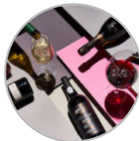
THE ENTHUSIAST 100 OF 2018