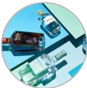
TOP 100 SPIRITS OF 2018