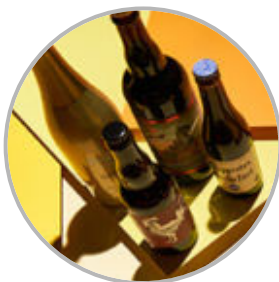
TOP 25 BEERS OF 2018